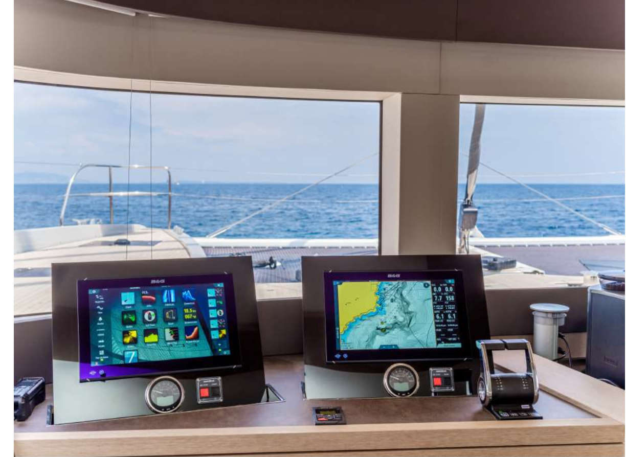
Earlybird - Mention obligatoire / Mandatory credit: Photo Nicolas Claris