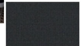
DARK GREY (SUNBRELLA - NAT 10030 300)