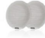
2 FUSIONS Loudspeakers in the salon