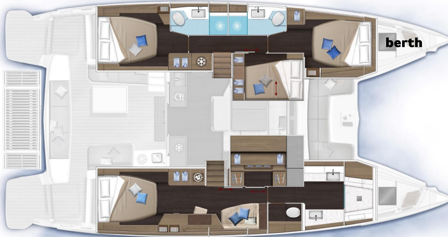
4 Cabin/ 3-bathroom Owner's layout