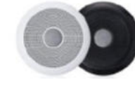
2 FUSION Loudspeakers in the cockpit 2 FUSION loudspeakers at the Flybridge