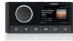
Fusion Apollo RA670